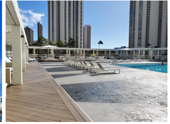
Ala Moana Hotel